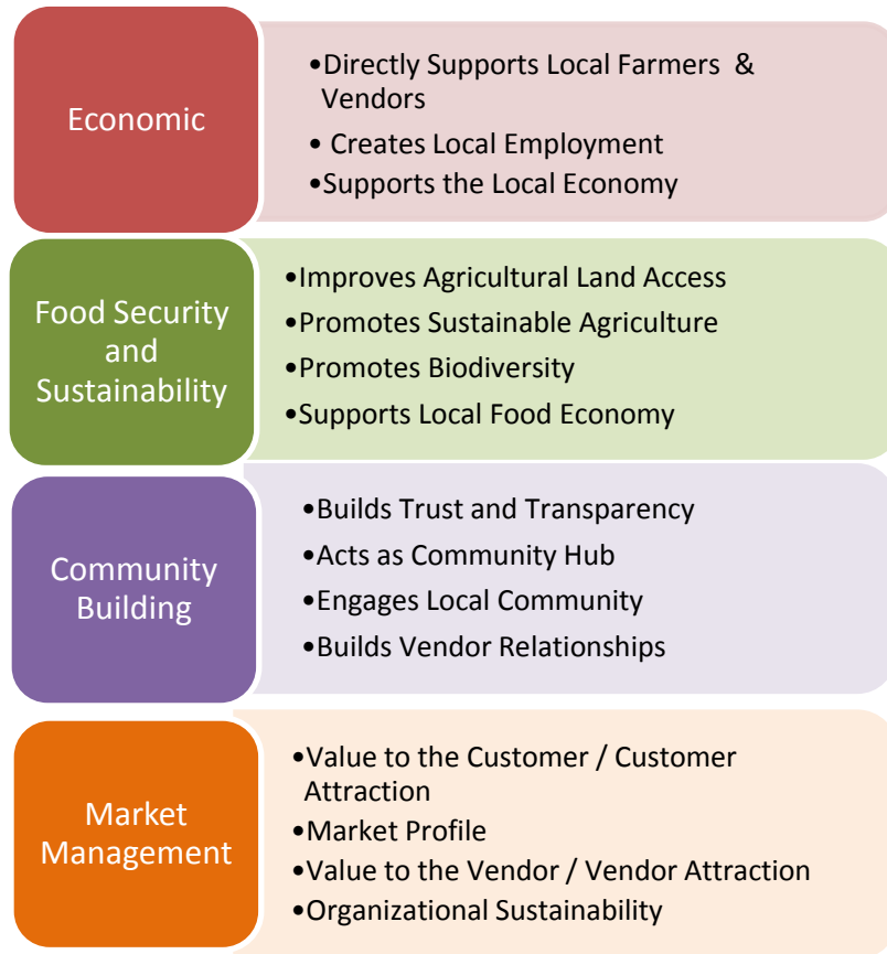
Figure 2. Specific outcomes included in the Toolkit

The draft toolkit directly built on existing data collection methods (Table 1) that respond to markets' key information needs (Table 2). In designing the toolkit, market managers told us they wanted the process to be simple and to keep questions consistent to allow for comparison across markets. Once recruited, pilot participants emphasized the potential for the toolkit to support operational performance and development, and to improve relationships with external stakeholders. For example, in explaining why a market wished to participate, applicants noted: